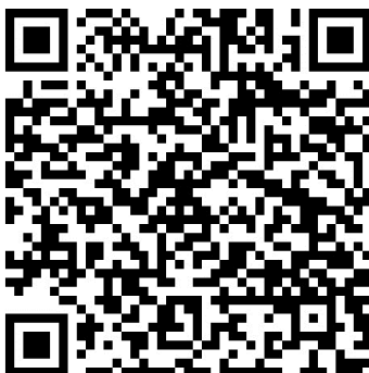
QR CODE FOR ALL SITES WEBSITE